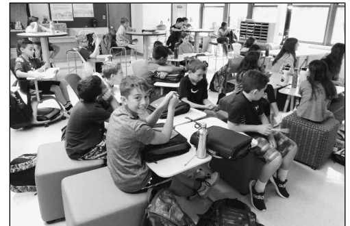
West Side School...