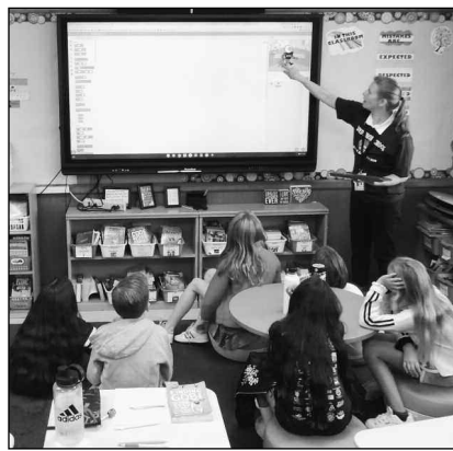
Promethean Board at Lloyd Harbor school...

Last year, a pilot program began to test out the Promethean Boards in each building. To date the district now has 42 at the Jr./Sr. High, 6 at Goosehill, 16 at Lloyd Harbor, and 12 at West Side. Thanks to District funding approved by the Board of Education, donations from the CSH Education Foundation, and administration, CSH school district is providing its students and staff the equipment and classroom settings that are cutting edge in education today! □