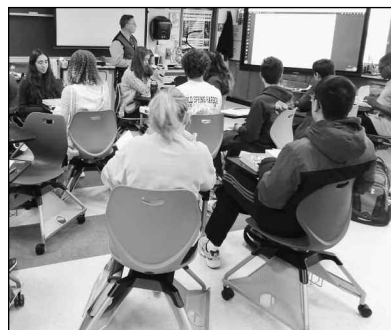
Jr./Sr. High school...