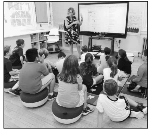
Teaching KidOYO on the Promethean Board at West Side school...