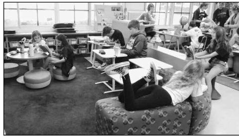
Lloyd Harbor School...

With the greater availability of Chromebooks there is no longer a need for desktop computers facing walls in computer labs with backs to each other. The beauty of flexible furniture spaces is that they can be designated for quiet studying or more collaborative group work. Seating can now be a choice, whether it's a couch, standing desk, rolling swivel chair with cup holders, bean bags, and more. Even Goosehill has low table seating with padded recliners, balance-ball, wooble and ergo stools, or a simple seat on the floor at a low table. Bright colored chairs also allow for easy student groupings. The classrooms now allow for greater collaboration, a more relaxed feel, and the ability to move, bounce, or swing your feet on a bar for students who have difficulty sitting still comfortably. Both comfort and movement have allowed for more productivity and focus.