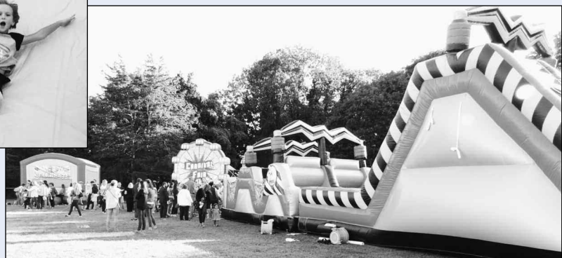
Goosehill Picnic: The annual "welcome back picnic" was held on September 13th to the delight of both students and parents. Bounce houses, music, pizza and fun were enjoyed by all. Definitely a family favorite event! Thank you GPFA!