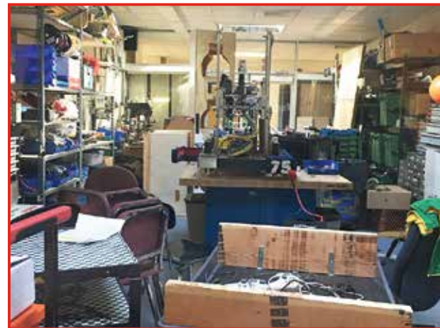
The space for Robotics at CSH Jr./Sr. High School is insufficient and can no longer accommodate the growing requirements of the program.