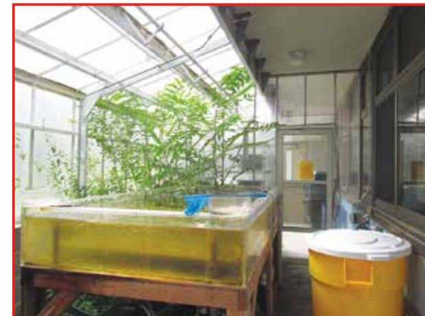
The current Coral Reef Project cannot survive in its current location at CSH Jr./Sr. High School.