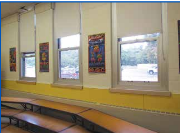
The music room at Goosehill Primary School does not adequately support the music program.