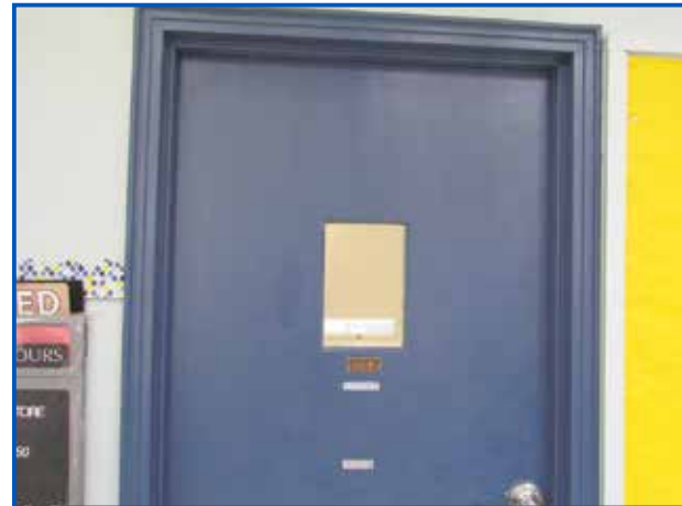
Classroom doors in all schools need enhanced security features.