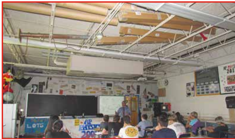
The current science classrooms are not able to support current and future curriculum needs.