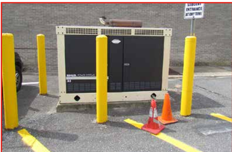
All schools are not equipped with full-building generators.