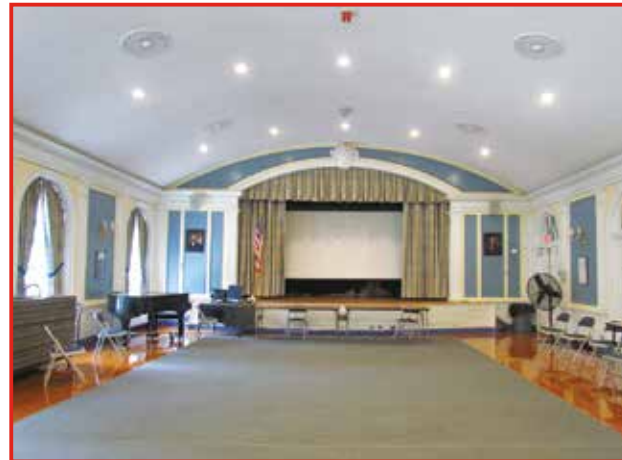
The Little Theatre at Lloyd Harbor Elementary School needs renovation to maximize use.