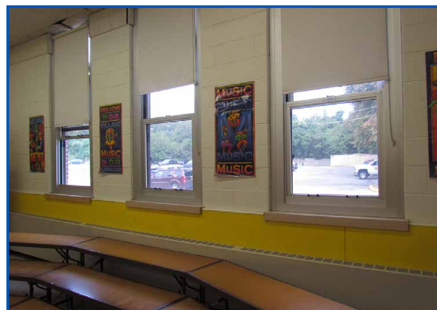
The music room at Goosehill Primary School does not adequately support the music program.