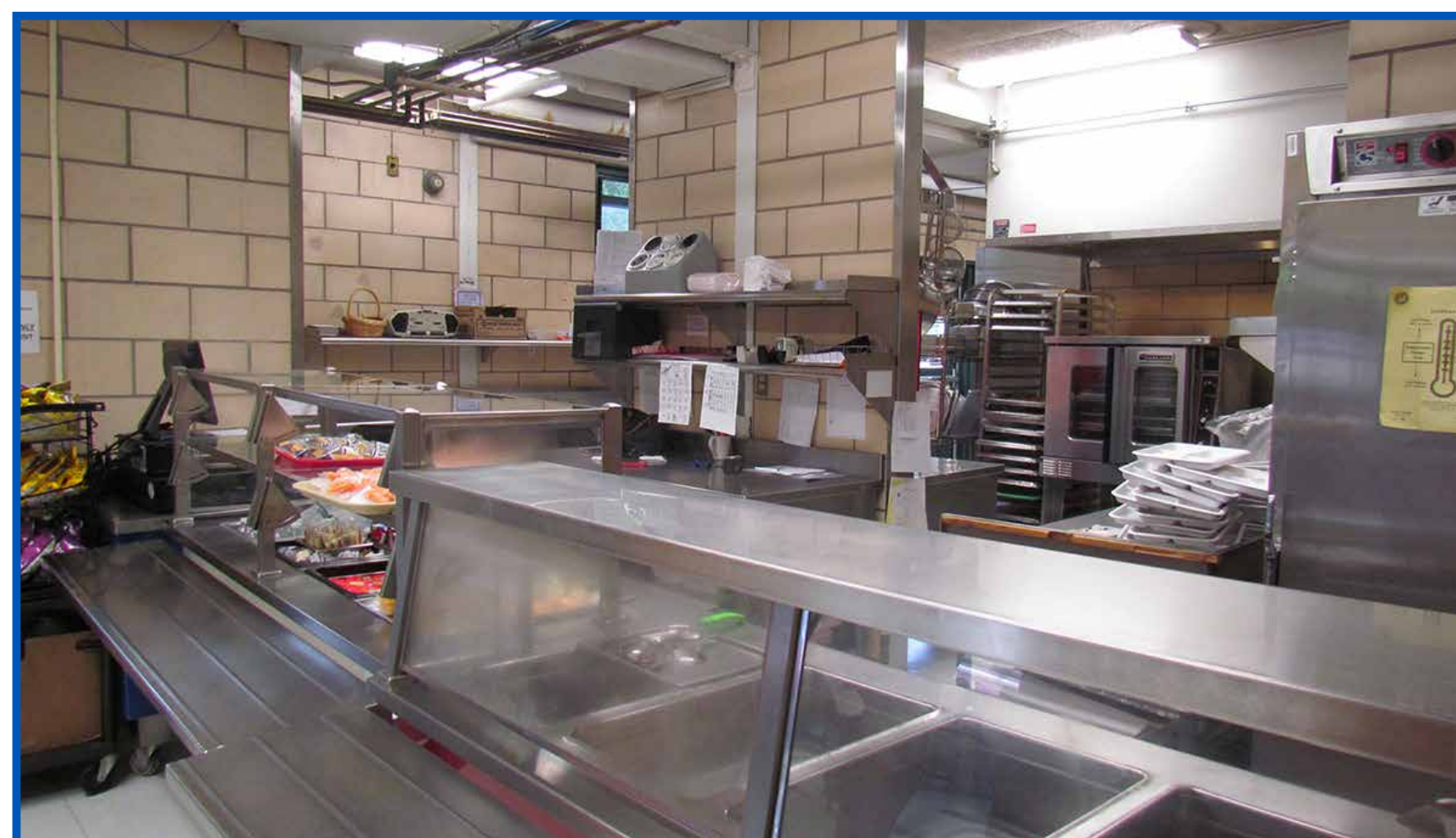
The kitchen at West Side Elementary School is insufficient in space and functionality.