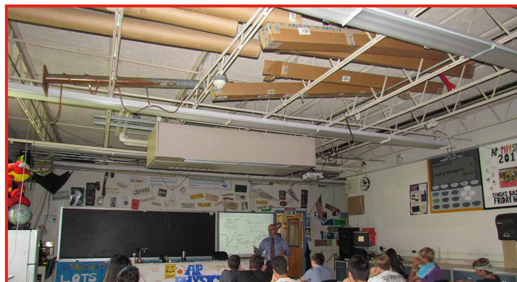
The current science classrooms are not able to support current and future curriculum needs.