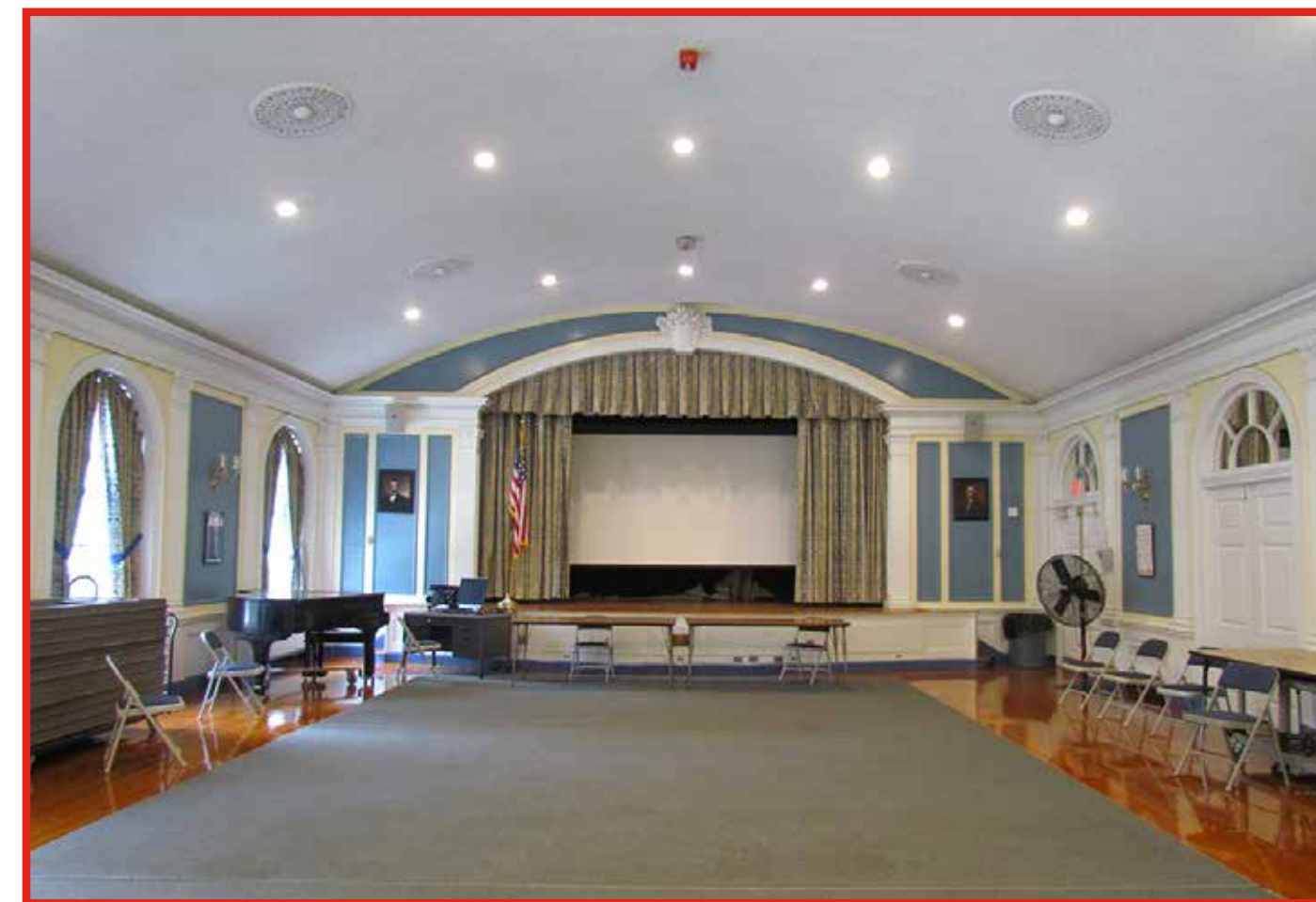
The Little Theatre at Lloyd Harbor Elementary School needs renovation to maximize use.