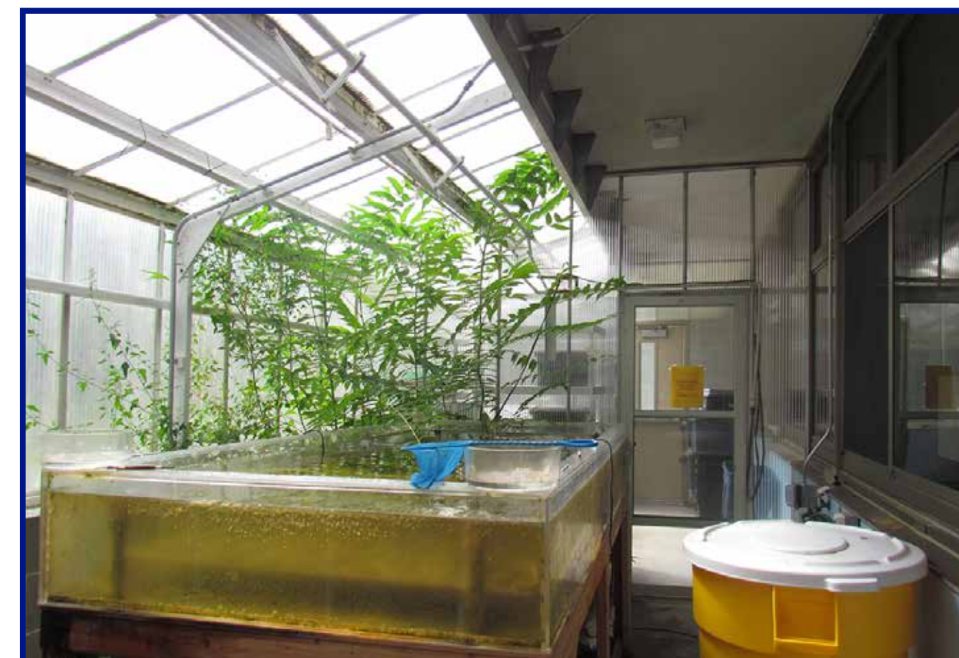
The current Coral Reef Project cannot survive in its current location at CSH Jr./Sr. High School.