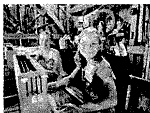
Weaving on looms

Campers will be able to wear colonial costumes, play original colonial games, tour historical sites, handle various historical artifacts that typically are viewed only behind glass displays in museums, and enjoy hands-on colonial-era activities such as: