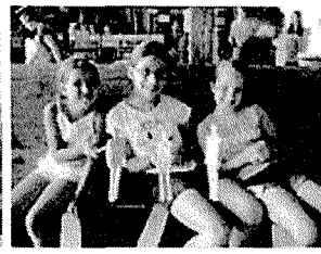
Limberjack toy making