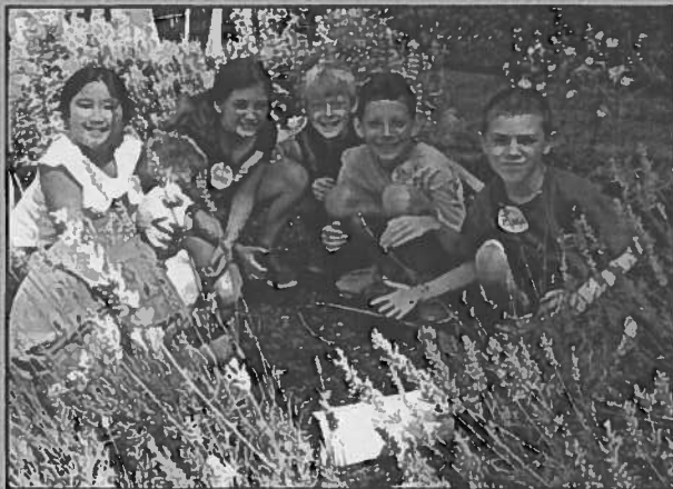
Tending to the kitchen herb garden on the historic Kissam property.