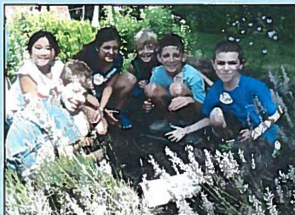
Tending to the kitchen herb garden on the historic Kissam property.