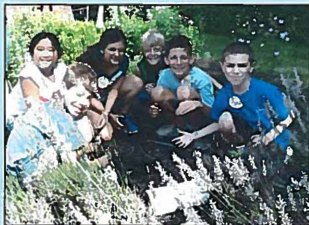
Tending to the kitchen herb garden on the historic Kissam property.