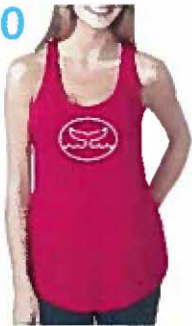
Terry Cloth Tank