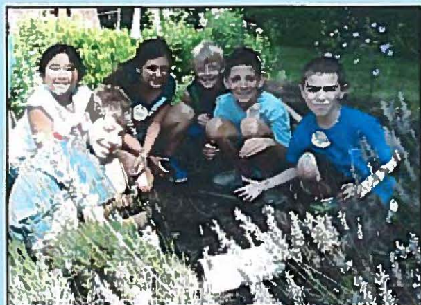
Tending to the kitchen herb garden on the historic Kissam property.