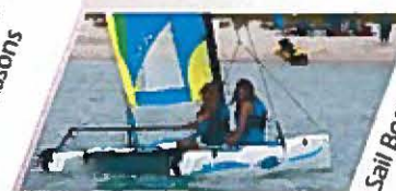
Sail Boat Rentals