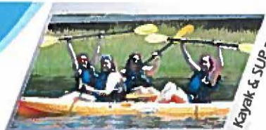
Kayak & SUP rentals

Whether you are a first time sailor or a seasoned racer, interested in dinghies, keel boats or cruising, we have an experience for you.