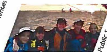
Public Sail Cruises