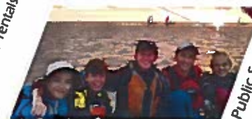
Public Sail Cruises