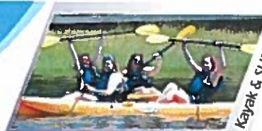
Kayak & SUP rentals

Whether you are a first time sailor or a seasoned racer, interested in dinghies, keel boats or cruising, we have an experience for you.