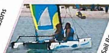
Sail Boat Rentals