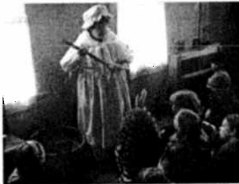
Historical building tours