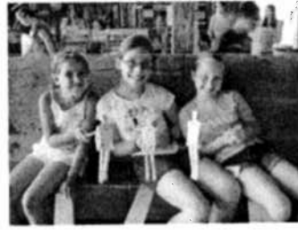
Limberjack toy making