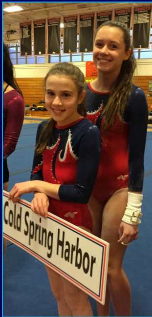
CSH Gymnasts at Individual Championship